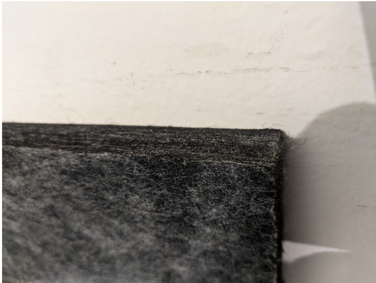
Figure 3 – Detail of specimen materials