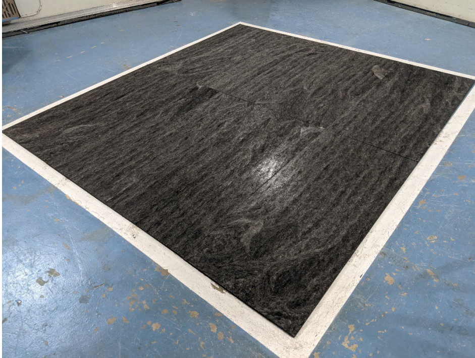
Figure 1 – Specimen mounted in test chamber